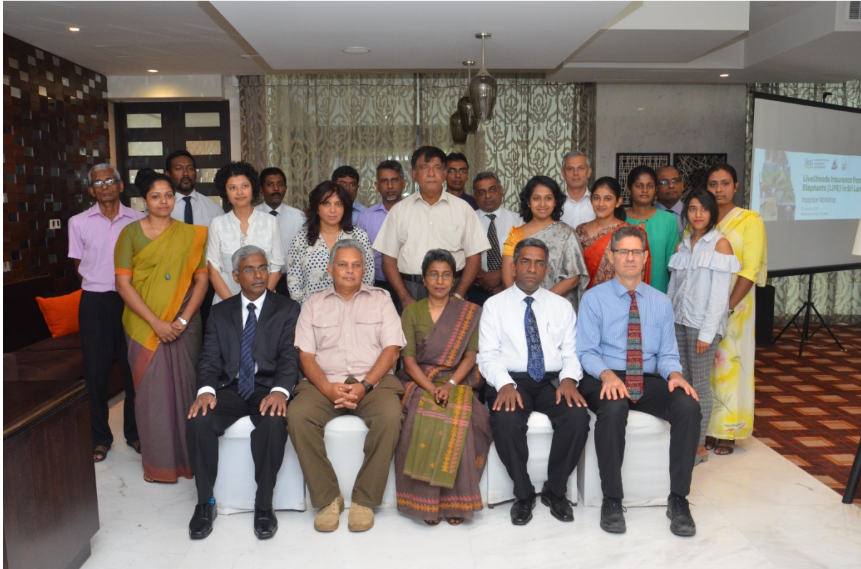
@ Institute of Policy Studies